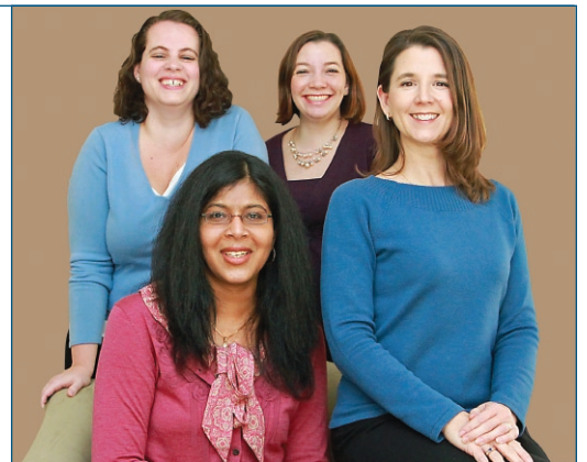
The people of Triangle Center for Behavioral Health